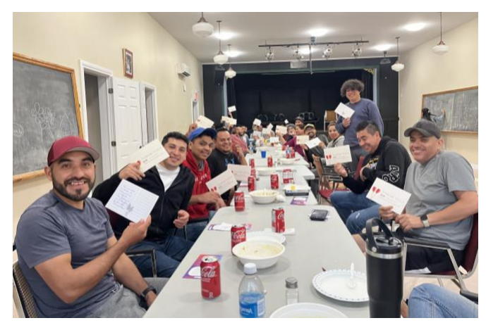
Meeting with workers, sharing a meal

Early in the year, Cooper Institute took part in a three-day planning session with the Migrant Rights Network (MRN), a coalition of various migrant justice organizations across Canada. Throughout the year we promoted MRN campaigns and events in the news media and online through social media. In September, in response to federal immigration cuts and rising xenophobia, we hosted a rally in support of migrants in our community.