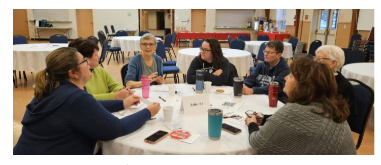
At the November forum on public services

The Coalitions first public event was a Summit held in Charlottetown in November. Engagement forums are planned for 3 Island communities in 2025. One will focus on preparing for the 2025 federal election.