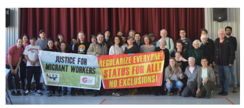
Excellent turnout for the Status for All Event in March!

In 2024, Cooper Institute continued to push for a regularization program for undocumented people in Canada. We have a history of working with undocumented people in our province and recognize the difficult challenges they face daily.